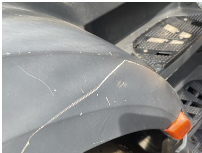
2: Door Moulding osf Scuffed (Unpainted) Over 100mm