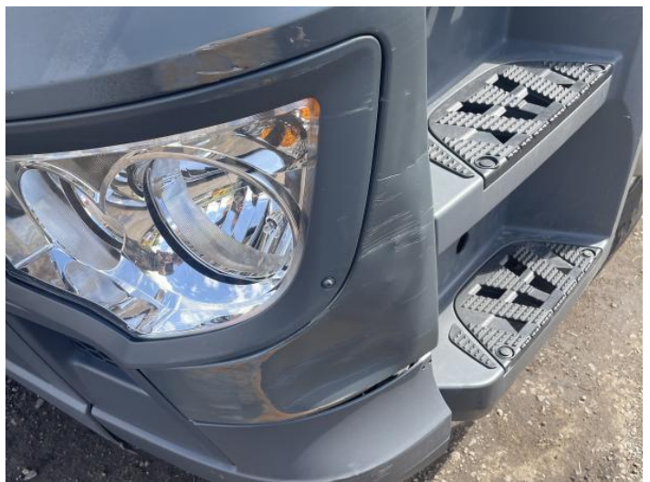
8: Bumper Front Moulding Scuffed (Unpainted) Over 100mm