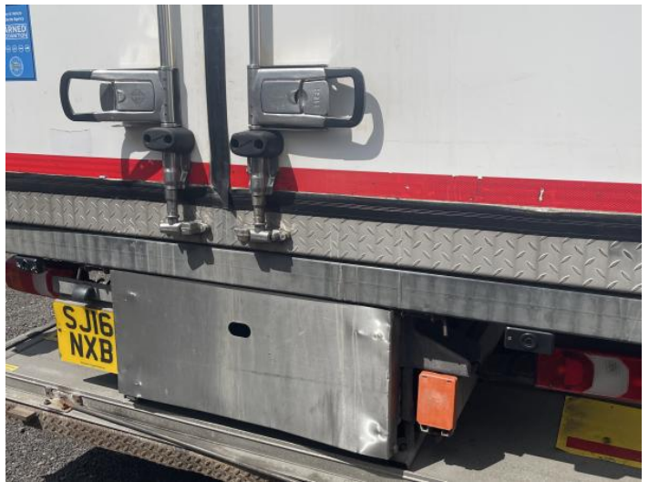
6: Tailgate Rusted Over 5mm