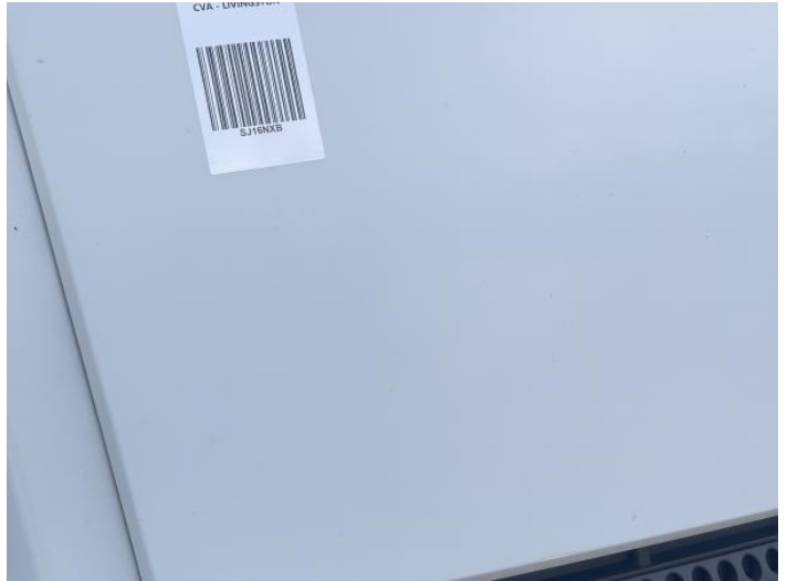
4: Bonnet Scratched UpTo 25mm Thru Paint