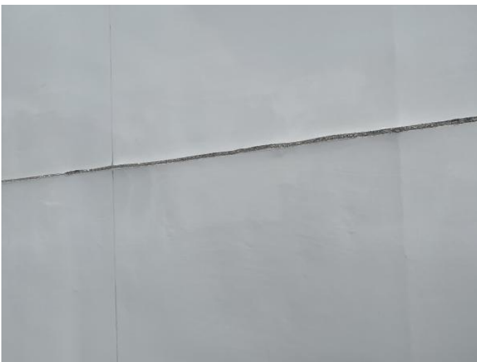
7: Qtr Panel nsr Dented With Paint Damage