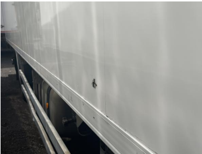
5: Qtr Panel osr Dented With Paint Damage