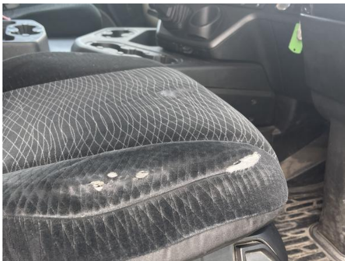
1: Seat Base Cover osf Torn Over 3mm