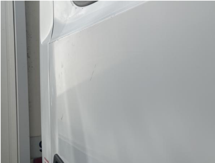
3: Door osf Dented With Paint Damage